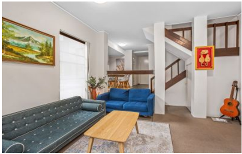
8/21-23 Fontenoy Road Macquarie Park NSW

Solid Build, Boasting Potential, Prime Locale!